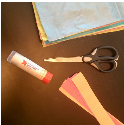
MATERIALS & TOOLS