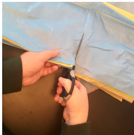
STEP 1: If using 20 inch tissue paper, CAREFULLY cut 15 sheets into 10 inch squares.